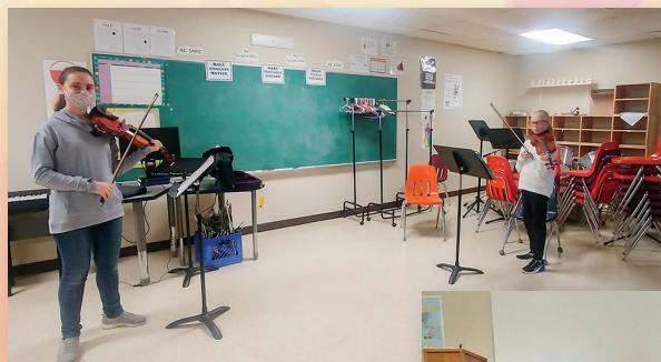
Caeley Zimmerman tutors Jade Sauder (Gr. 5) on violin.