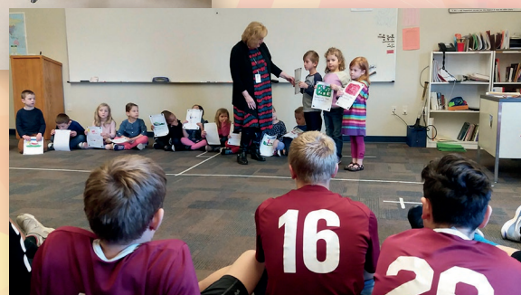
Kindergarten students share their stories with 8 th grade.