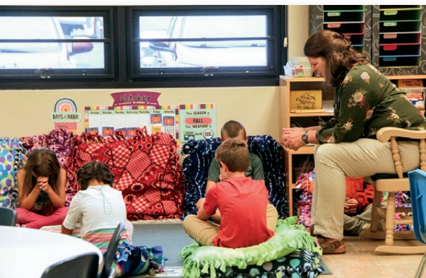
Morning prayer time in second grade