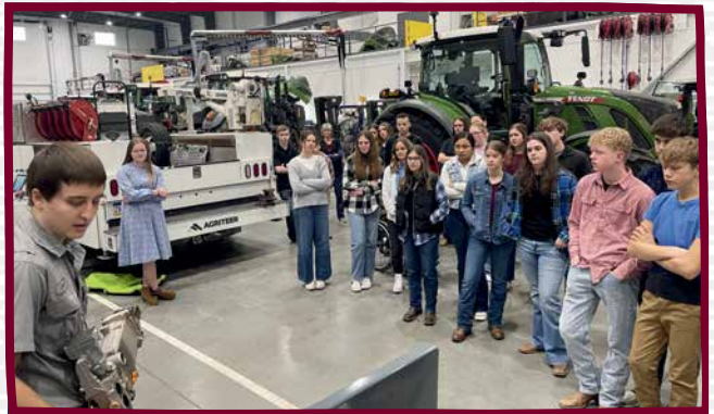
HMS High School students got a hands-on look at agricultural technology and innovation during their visit to Agriteer!

Additionally, the Lord has provided a larger team of teachers and staff for this next stage of development in our high school