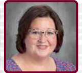
Elisabeth Fry Learning Support