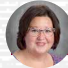
Elisabeth Fry Learning Support

The Learning Support program provides a compassionate, tiered system of academic, emotional, and developmental support—designed in partnership with families—to help every student thrive and succeed.