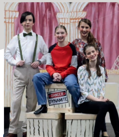
Part of the cast of 'Bringing Down the House' performed in 2025