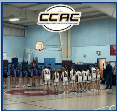
The 2017-18 season, HMS joined the CCAC which challenges students for higher level competition